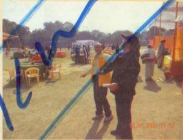
SDDGM's Volunteers at Food Stall & Kite-Flying Competition .... during Gujarati-Food Festival Celebration on Jan16 th 11, Sardar Patel Vidyalay ...as a part of Gujarat-Swarnim Mahotsav