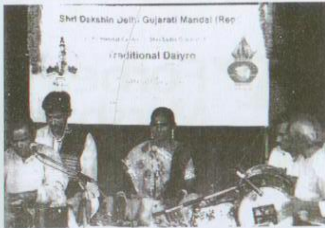
Daiyro-Artist from Surendra Nagar entraining the audience of New Delhi at India Habitat Centre's Stein Auditorium on 11- June '10.

Traditional Daiyro by group of Artists from Surendra Nagar-Gujarat on 11 th Jun. '10 at India Habitat Centre, New Delhi